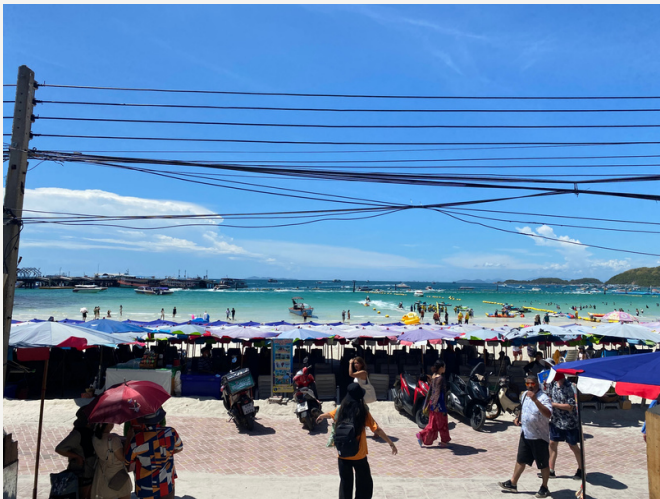
Weekend trip to Pattaya