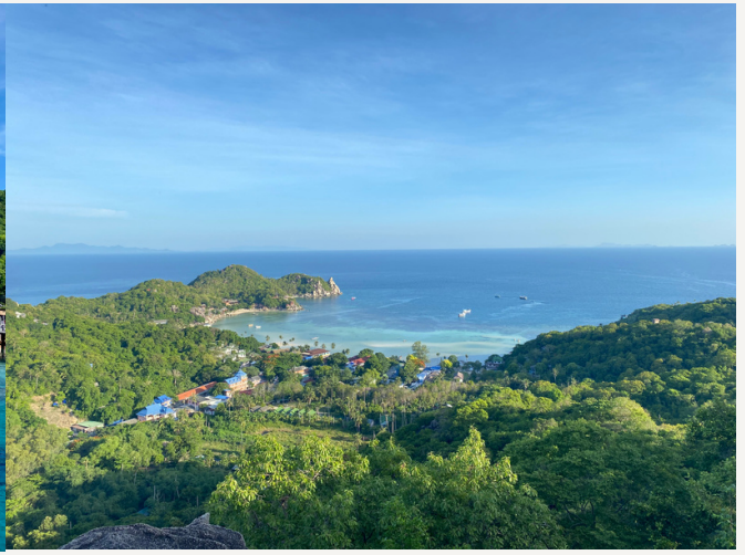
Weekend trip to Koh Tao